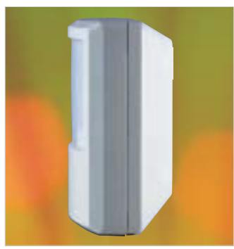
Discrete, Low Profile Design