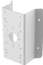
DS-1276ZJ Corner Mount