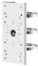
DS-1275ZJ Vertical Pole Mount