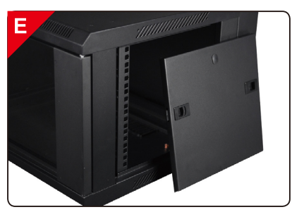
Removable side panels simplify your installation of accessories and monitoring of IT equipment.