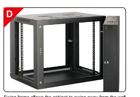
Swing frame allows the cabinet to swing away from the wall for easy access to equipment and cabling.