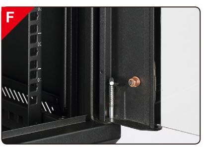
L-shaped spring pin make it fast to install front door to the frame and easily to change door opening direction.