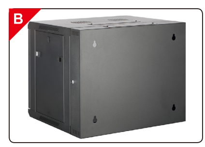
Slots in back ensure convenient and guick wall mounting.