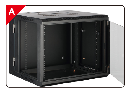
Welded structure can be easy assembled.