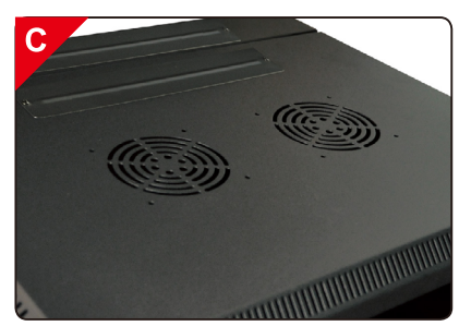
120mm*120mm fans can be preinstalled on the top cover. Relevant fan tray suit to all safewell wall mounted cabinets. (Brush panel is optional for cable entry panel.)