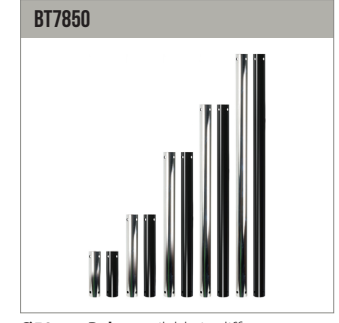
Ø50mm Poles available in different lengths up to 3m