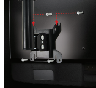
Quick and easy 'hook-on' installation