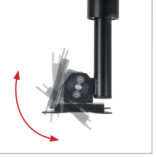
Easy tool-less adjustment of tilt, swivel and