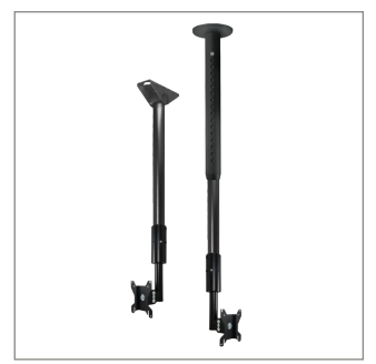
Suitable for use with B-Tech's range of System 2 poles and ceiling mounts