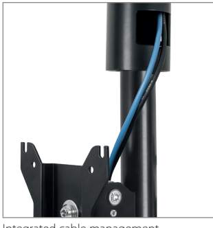
Integrated cable management for a neat and tidy installation