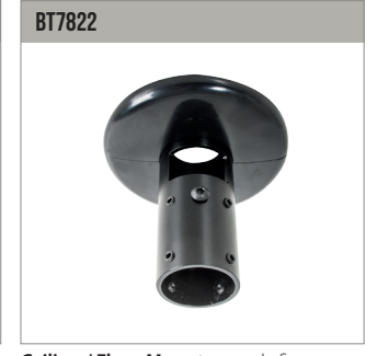
Ceiling / Floor Mount securely fixes \emptyset 50mm poles to the ceiling or floor