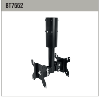
Back-to-Back Flat Screen Mount is ideal for mounting two screens to \emptyset 50mm poles