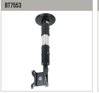
Flat Screen Ceiling / Desk Mount includes all components needed to create a complete mounting solution